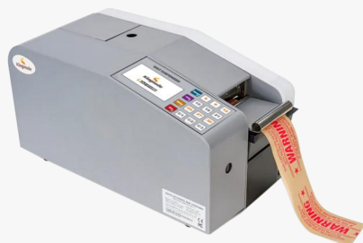
KN-366Hi 1000 ft roll capacity